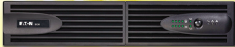
EATON® 5130 2200VA

Eaton ROCKS the competition in price, features and performance!